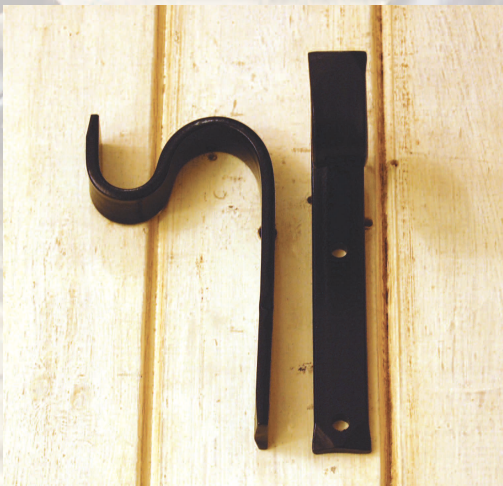
Standard Bracket BT001

Hand-finished curtain rings, available in all colours. Ideal for 25mm poles.