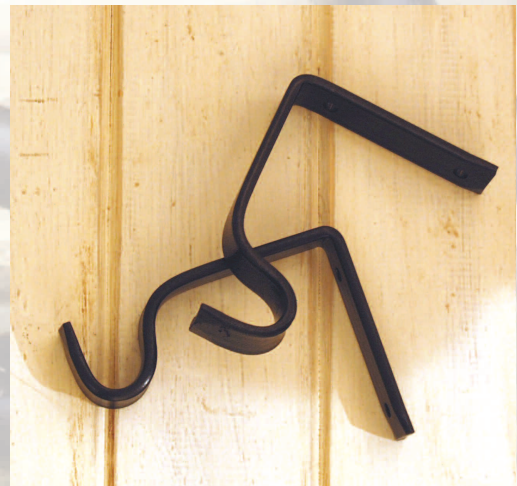
Long Bracket BT006

The most commonly used bracket, all handforged. Depth from wall to centre of pole: 58 mm*