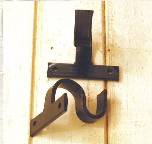
Centre Bracket BT002

Hand-finished curtain rings, available in all colours. 32mm internal diameter. Ideal for 16mm and 20mm poles.