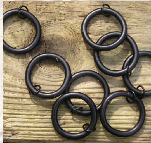
Large Rings RG002

Used in a recess where finials are not appropriate. Depth from wall: 6mm*