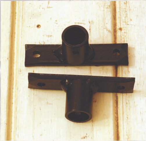
Wall Socket BT003

Available in Matt Black | Antique Cream | Satin Black | Verdigris | Burnished Steel | Bees Wax