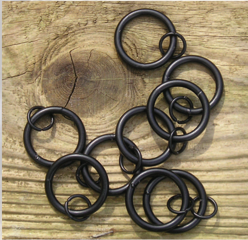
Standard Rings RG001

Hand-finished curtain rings, available in all colours. 32mm internal diameter. Ideal for 16mm and 20mm poles.