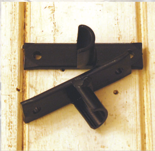
Cup Recess Bracket BT005

Perfect for adding extra support on long poles or where vertical space is limited. Depth from wall to centre of pole: 58 mm